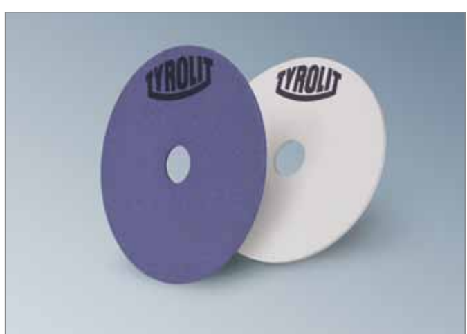
Conventional grinding tools

Specially adapted grain qualities and innovative bond systems combined with an efficient grinding wheel design