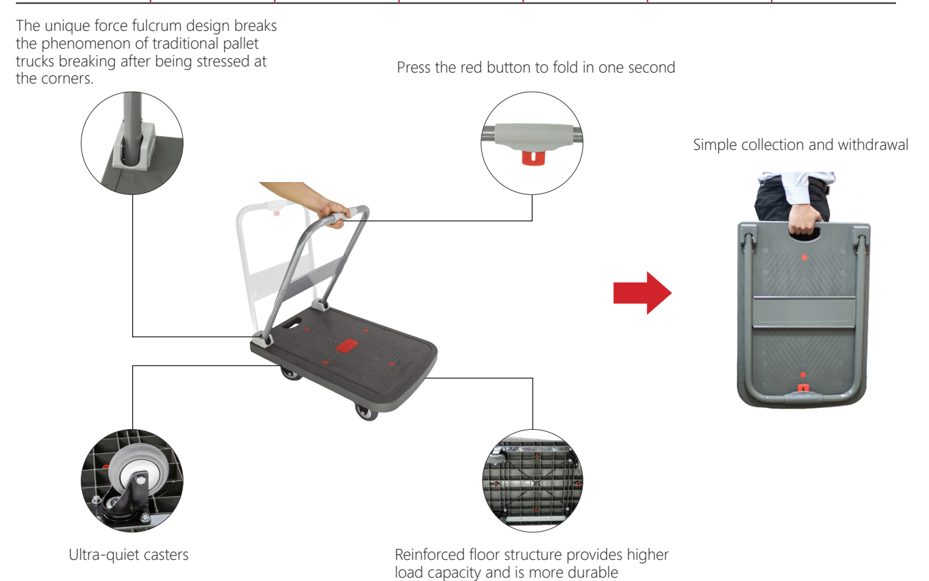
\label{eq:hickwall} \mbox{HICKWALL TECH CASTER INDUSTRIAL CO., LTD.}